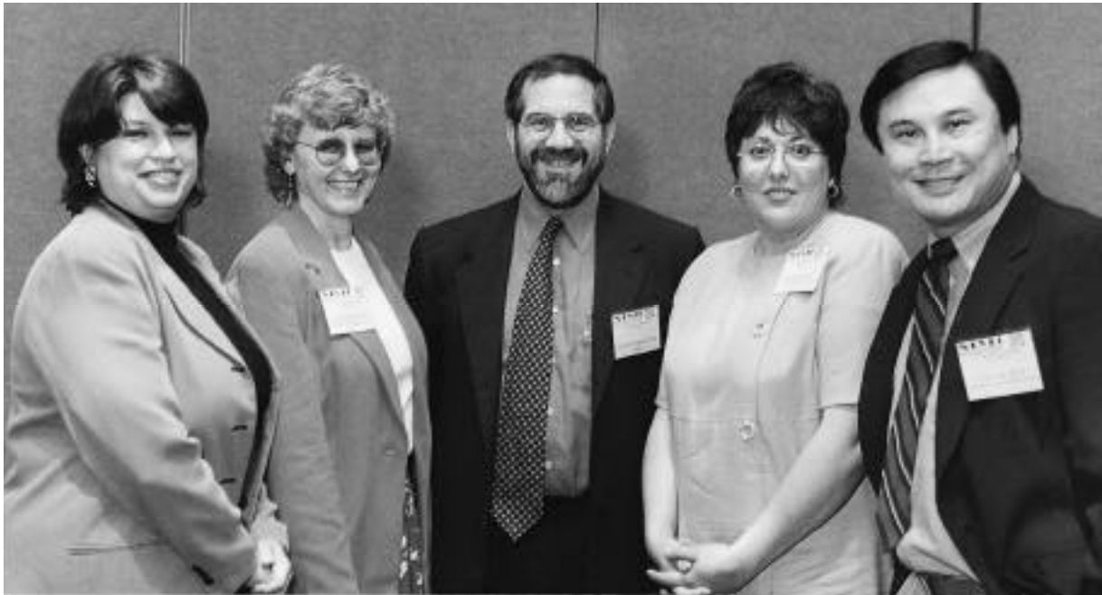
NIMH Research Roundtable Meeting, Washington, D.C.

New York State Department of Health, Early Intervention Program. (1999). Clinical practice guideline: The guideline technical report. Autism/ pervasive developmental disorders, assessment and intervention for young children (Age 0-3 Years) . Albany, NY: Author.