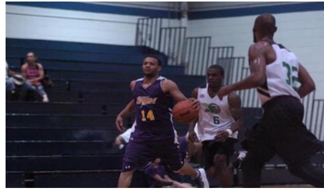
Hornets Take Down Storm!

CBL's efforts have been noteworthy, including making educational fliers about autism available to their basketball crowds and publicizing ASAT's mission to provide information to those affected by autism. In addition, we are thankful to CBL for raising over $100 for ASAT on their very first promotional night!