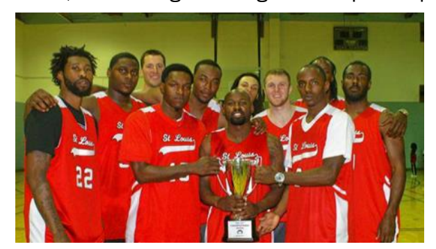
St. Louis Hawks, League Champions!

close on June 23<sup>rd</sup>. Congratulations, St. Louis Hawks, for winning the League Championship!