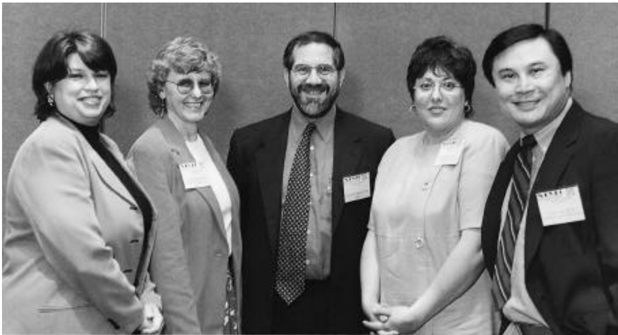
NIMH Research Roundtable Meeting, Washington, D.C.

New York State Department of Health, Early Intervention Program. (1999). Clinical practice guideline: The guideline technical report. Autism/ pervasive developmental disorders, assessment and intervention for young children (Age 0-3 Years). Albany, NY: Author.